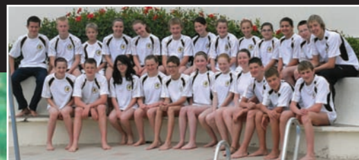
La Santa Swim Squad