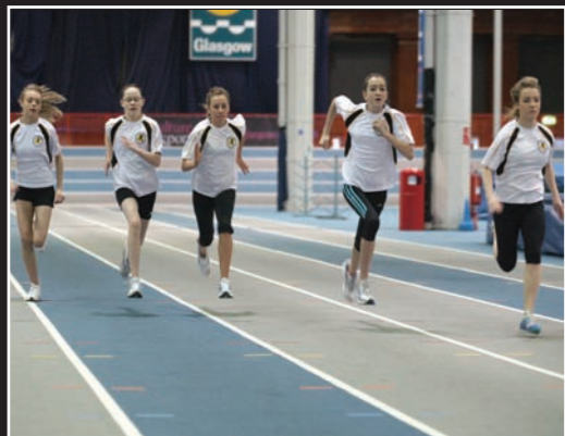
Glasgow School of Sport girls sprint for the line