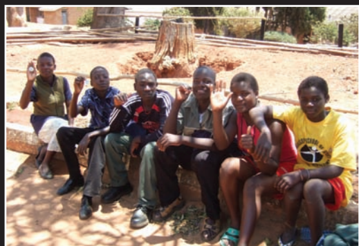
Mzuzu Government School medalists